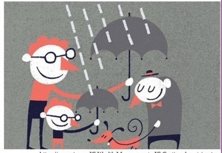
https://www.ig.ca - IG Wealth Management - IG Gestion de patrimoine